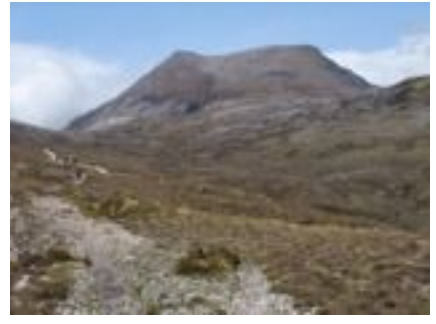
Meall a Ghubhais 887m BEINN EIGHE National Park

Each year in early May an extraordinary event occurs in the Scottish Highlands. A group of veteran mountaineers with a record of ascents of routes on major peaks in all areas of the world, and all members of ULGMC, meet for a week at some exotic venue in these Mountains with eyes set on climbing as many Munros or Corbetts as the weather and spirit enables.