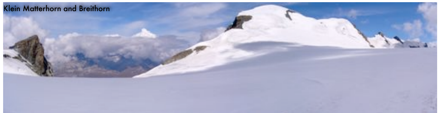
Klein Matterhorn and Breithorn

Want to submit a report? 1 November latest