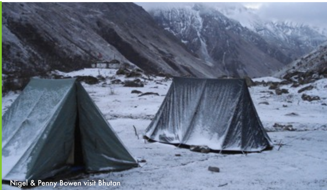
Nigel & Penny Bowen visit Bhutan